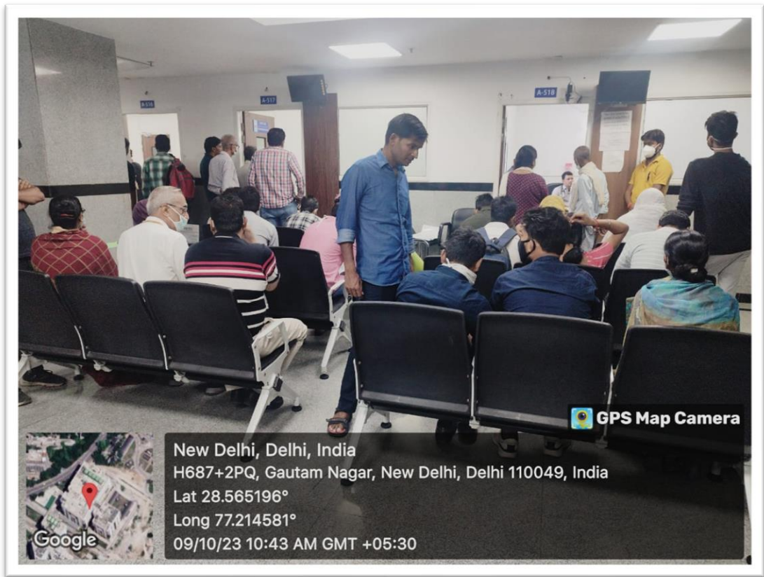
Field work & Data Collection in AIIMS